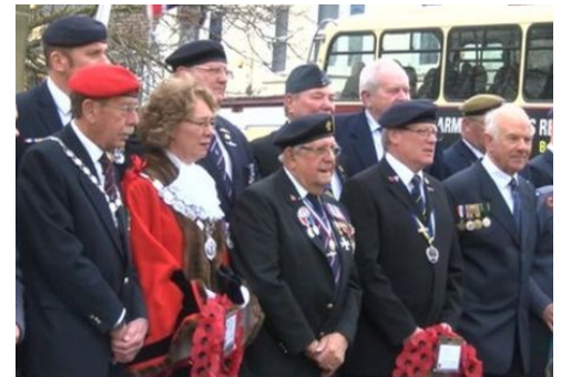
Remembering the ten men of Bridlington That lost their lives on the same day in WWI